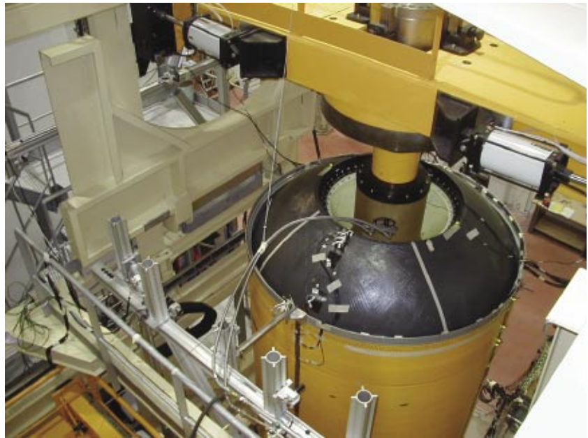
View of a tank in testing preparation phase

Realised by Holo3 for EADS SPACE TRANSPORTATION